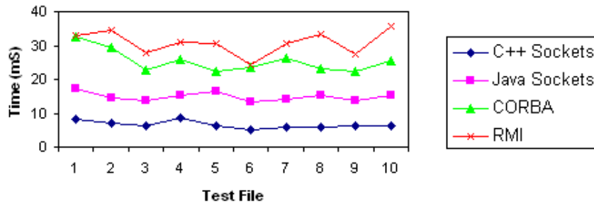
Figure 1: Average echo times of the four implementatins.

The average echo times over 10 runs for each of the files containing 10 strings are represented in Figure 1. As expected the socket-based implementations provided the fastest times. The Java-based socket implementation is slower due to VM and JNI conversion overheads. CORBA was approximately 4 times slower than the C++ sockets while RMI provided the slowest times overall. These results may be influenced by the choice of a particular VM or CORBA implementation.